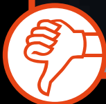
Standard welding torch: strong fume production!