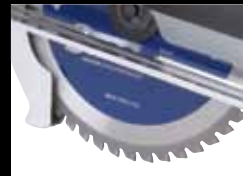
84MM DEPTH OF CUT