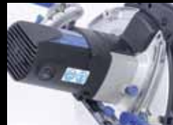
HIGH TORQUE MOTOR